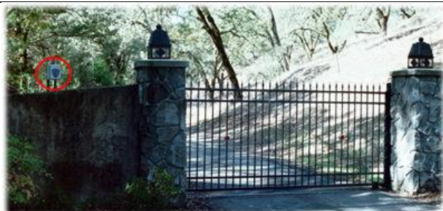
A properly installed C2E box is clearly visible to approaching traffic.

The C2E plastic enclosure has mounting brackets molded into it (the C2E comes complete as one box). We suggest that you use security head screws or bolts when mounting the unit, to prevent theft. For projects that require a more low profile approach the C2E can be mounted out of sight and a smaller external LED/Activation box (kit) can be used. The C2E activation LED circuit can operate the external LED in parallel up to a distance of 100 Feet from the control unit. Call your Wholesaler, Dealer, or Click2Enter, Inc. to ask about this additional kit (Part Number): EABL12VDC Exit Activation Box & LED (see below Section 8 for more details)