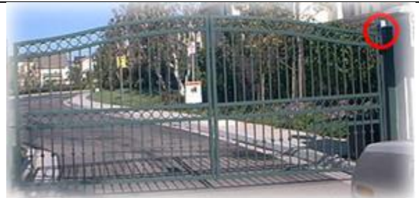
This is an improper installation. The box does not face oncoming traffic. The indicator light cannot be seen by emergency personnel.