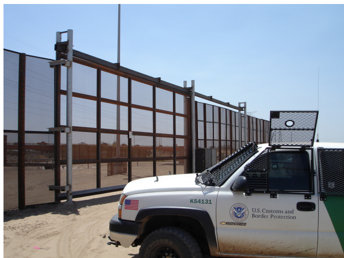
This photo shows a typical slide gate installed in the Rio Grande Valley Border Fence.

Pres Release Supplemental Photos (Please contact us for photo file support):